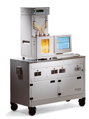
Upgrade the 481 at any time to enable fully automated high-throughput testing using Herzog's MP 491 Automatic 48or 96-Position Sample Changers.